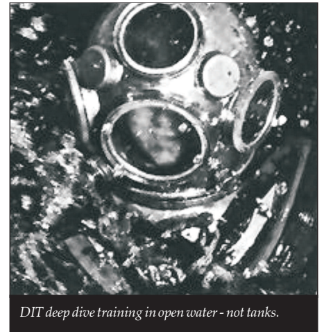
DIT deep dive training in open water - not tanks.