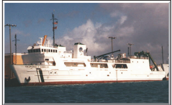
JMS recently conducted inspections aboard the R/V KA'IMIKAI O KANALOA for the University of Hawaii. This is required for NSF science operation funding.

The National Science Foundation [NSF], University-National Oceanographic Laboratory System [UNOLS], the Office of Naval Research, and the U.S. Army Corps of Engineers have recognized JMS as