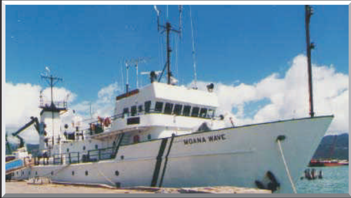
Because of their R/V operations expertise, JMS was selected by the Office of Naval Research to conduct a decommissioning survey of the R/V MOANA WAVE.